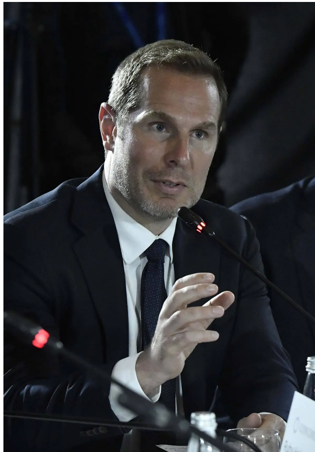
Peter Marocco attends a 2019 summit in Bogota, Colombia.

Now one of the most powerful people in the U.S. government, Peter Marocco's turbulent tenure during the first Trump administration sheds light on his current efforts to dismantle the American foreign aid system from the inside out.